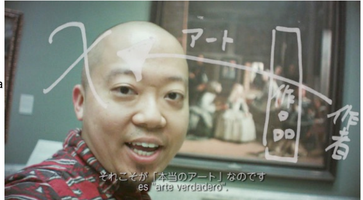
"Art (Spain Ver.)", 2015

egØ - Reexamining the Self -, punto, Kyoto