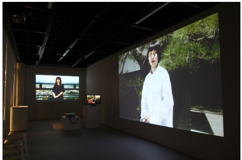
Solo Exhibition "The most beautiful moment in my life" 2018 Installation view (Doshisha Women's College of Liberal Arts Gallery, Kyoto)