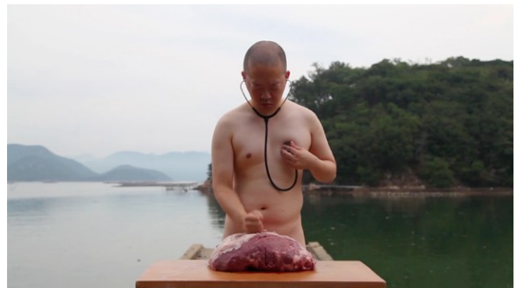
"Alive / Not alive (2014.8/Ushimado)", 2014 Single channel video with sound, 9min.32sec.

Graduation Exhibition, Kyoto City University of Arts, Kyoto