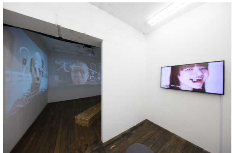
Solo Exhibition "Art and Artist" 2016 Installation view (WAITINGROOM, Tokyo)