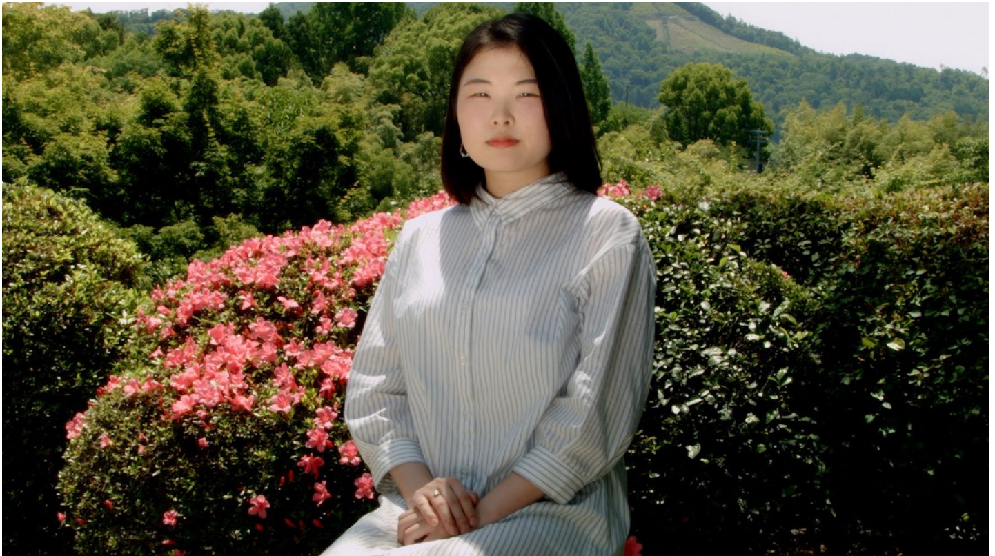
"The most beautiful moment in my life" 2018, single channel video with sound